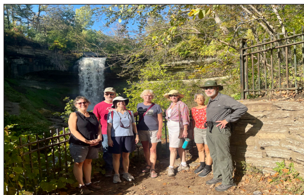
Members of the UMRA Hiking Club hiked to Minnehaha Falls from the Mel-O-Glaze Bakery in Minneapolis in October.

Newcomers are welcome! To sign up (required) for these hikes, go to umra.umn.edu > Programs & Events > Annual Calendar and search by the date.