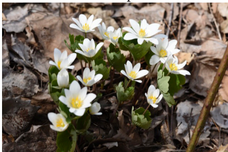
Photographing flowers like this bloodroot is one way Carol Urness enjoys "traveling" to interesting areas close to home.

us have to give up travel to distant lands, usually due to physical limitations. This doesn't mean we have to stop learning through travel, especially travel near us, even in our backyards. In this presentation, we will consider ways to "travel" in interesting areas near home.