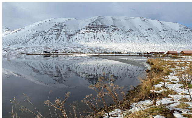
The town of Ólafsfjörður in northern Iceland, nestled between the mountains and the sea, is connected by tunnels to two neighboring fishing villages.